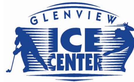
Figure Skating Lessons